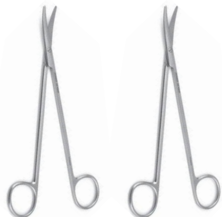
Metzenbaum Scissor Curved 8 inch