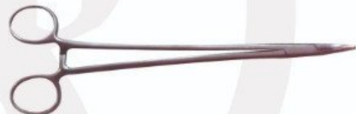
Needle Holder Curved (10")