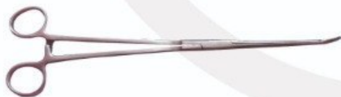
Gemini Mixture Artery Forceps