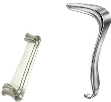
C Retractor Set of 3