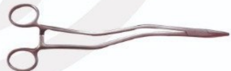
Needle Holder Angular (10")

Manufacturer, Supplier, Importer & Exporter of :