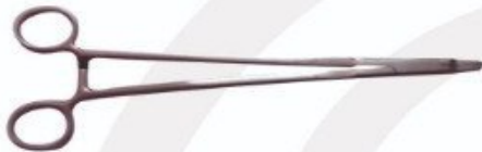
Ryder Needle Holder