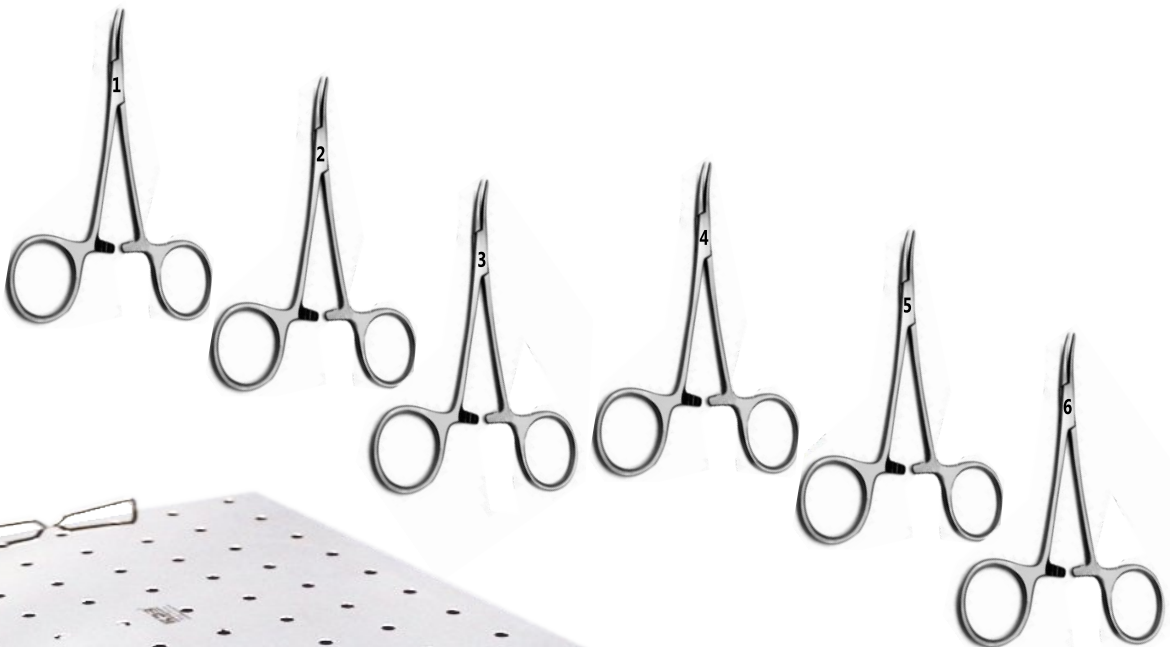
Mosquito Forceps (5") with 1 - 6 marked for easy identification for suturing