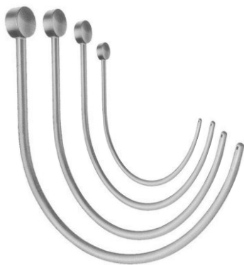
Hey Groove Urethral Dilators Set of 4 Pcs.

The Boyle Davis mouth gag with Tonsil plates, adult 5 blades. This instrument is part of the tonsillectomy set. Mouth gags are used to keep the patient's mouth open during oral surgery, leaving both hands of the surgeon free to operate. The Boyle Davis mouth gag consists of the Davis gag, a frame that serves to hold the mouth open and the Boyle tongue depressor to hold the tongue down. The tongue depressor comes in several sizes, from pediatric to adult. The instrument is assembled by sliding the tongue blade into the frame.