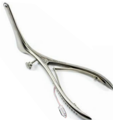
Nasal Speculum Fiber Optic