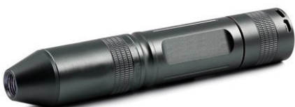
LED Hand held Light Source