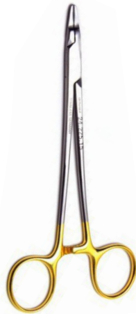
Needle holder 3-0 6 inch T.C. Gold