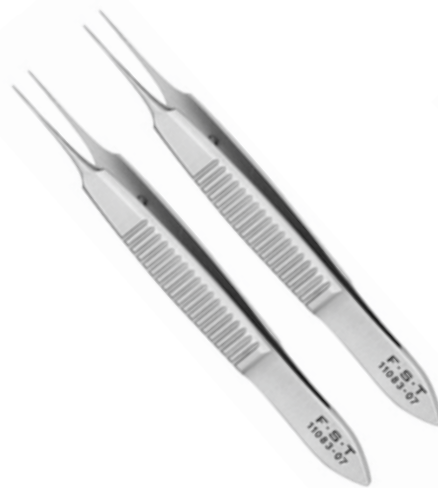
Fine Tooth Forceps