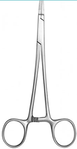
Ryder Needle holder 4-0 8 inch