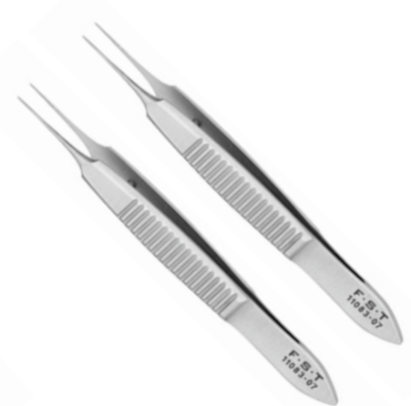
Plain Fine Forceps